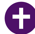
ILLUSTRATION: STINA LÖFGREN, SK18174, ENGELSKA.

You can find contact details and more specific tips at svenskakyrkan.se/forstahjalpensorg